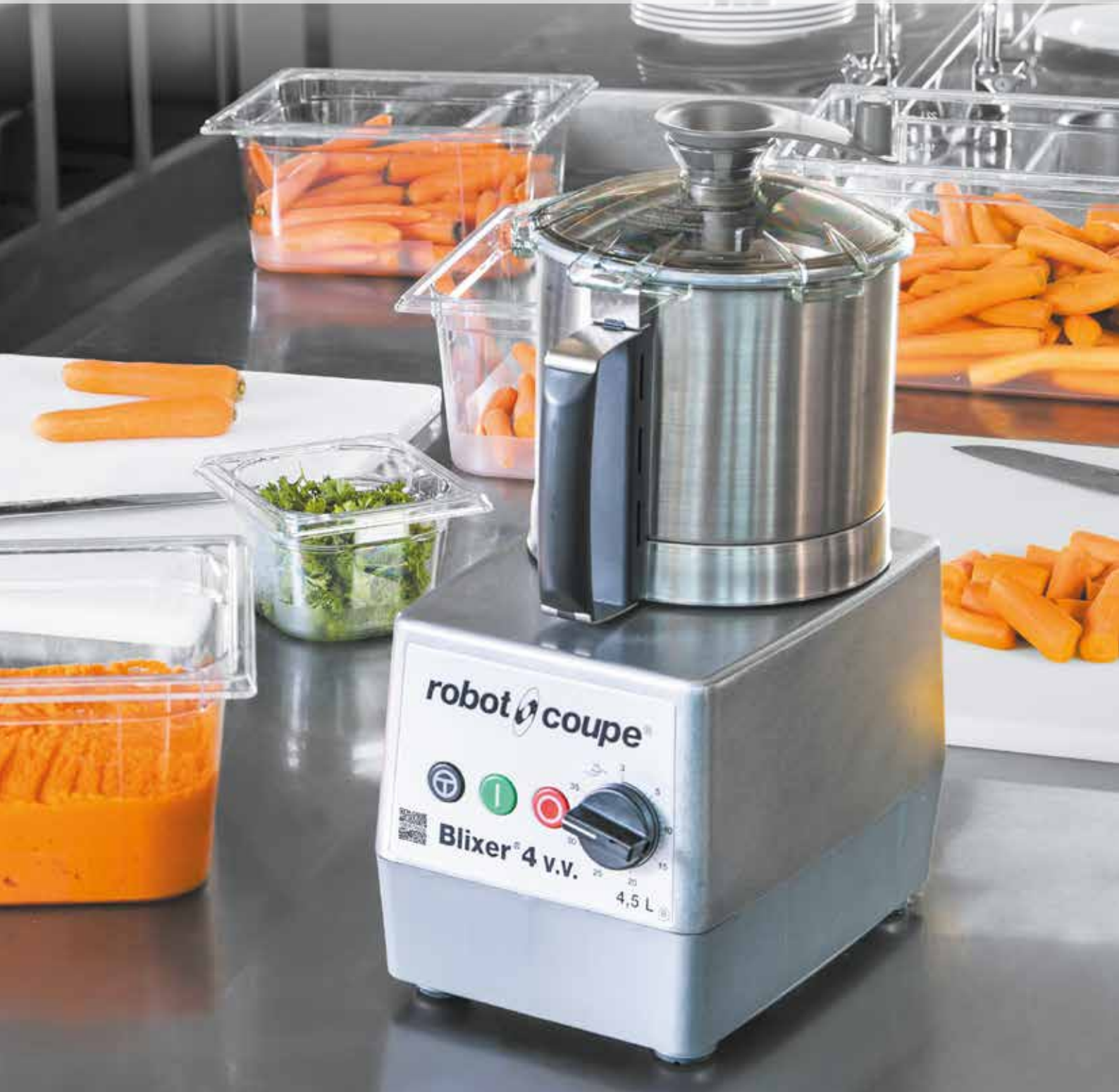
Table-top models: Blixer® 2, Blixer® 3, Blixer® 4, Blixer® 4 V.V., Blixer® 5, Blixer® 5 V.V., Blixer® 7, Blixer® 7 V.V.

HOSPITALS - RETIREMENT HOMES - CRÈCHES - RESTAURANTS